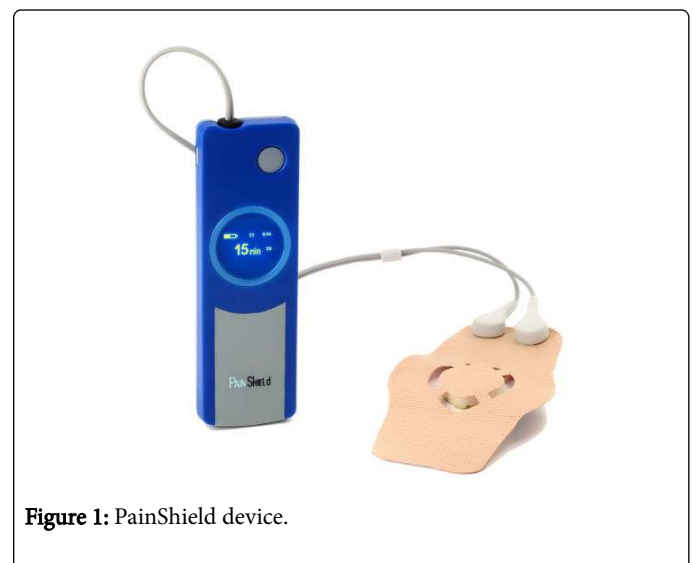
Figure 1: PainShield device.

Ultrasound is a directed acoustic wave that has varying physiological effects depending on the intensity, frequency, and amplitude of the wave. Acoustic waves range from Surface Acoustic Waves (SAW) at the low end of frequency to Shockwaves at the high end. SAW has been shown to decrease inflammation, cause neo-