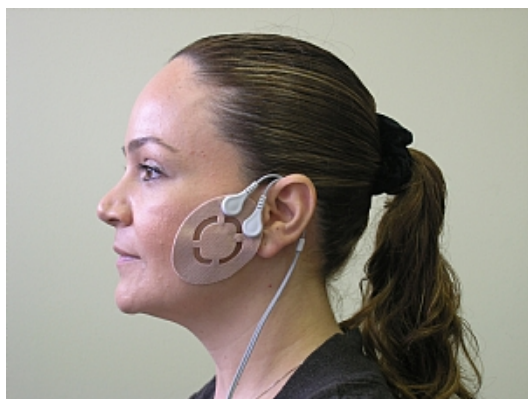
Figure 2: PainShield placement for TN.

The PainShield is a self-contained SAW device, comprising a driver and an actuator patch. The patch generates acoustic waves at approximately 96 kHz. The patch is attached on the lateral face (Figure 2), and if necessary can be further held in place with a self-adhesive bandage. The device produces active acoustic waves for 30 minutes and then idles with no acoustic wave generation for thirty minutes. The device cycles for six and a half hours before automatically shutting off.