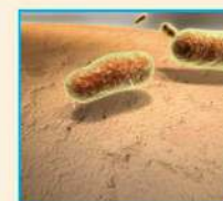
Figure 1: Illustration of bacterial attachment to catheter surface

After performing successful animal studies, the first clinical study showed that biofilm formation can be prevented or delayed by applying low energy nanowaves along the surfaces of an indwelling catheter. This approach opens new options for prevention and/or non-antibiotic treatment of urinary tract infections. In addition, UroShield is being studied in the area of enhanced in-vitro penetration of antibiotics into the biofilm structure. There is also ongoing research on the ability of UroShield to reduce pain and discomfort associated with indwelling urinary catheters.