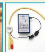
Figure 2: UroShield from NanoVibronix